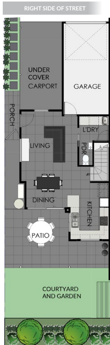
TYPE D1: Ground floor plan