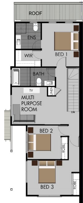
TYPE C1: First floor plan

This plan, dimensions and information are indicative only and may vary without notice. Furniture or vehicles are not included in the sale of the lot. The image depicted here is indicative only. Facade finishes and colours may vary.