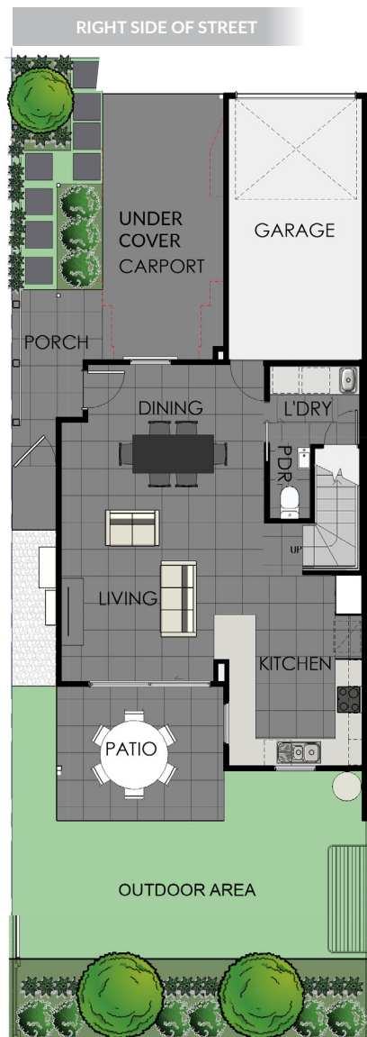
TYPE G1: Ground floor plan